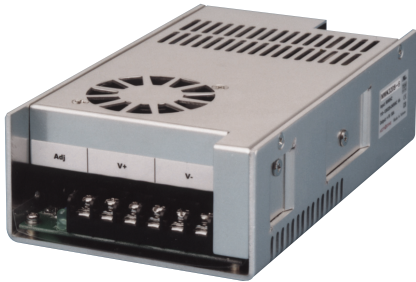
4"W x 7"L x 2"H